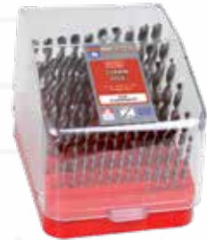
Sada vrtáků 91-dílná v plastovém stojánku s víkem 91 pcs drill set in plastic stand with lid 91-teiliger Bohreratz in Kunststoffhalter mit Deckel